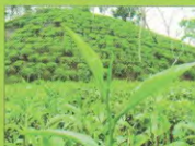
Tea Garden, Sylhet