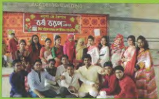
Bangla New Year Celebration