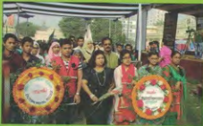
21 February/ International Mother Language Day observation