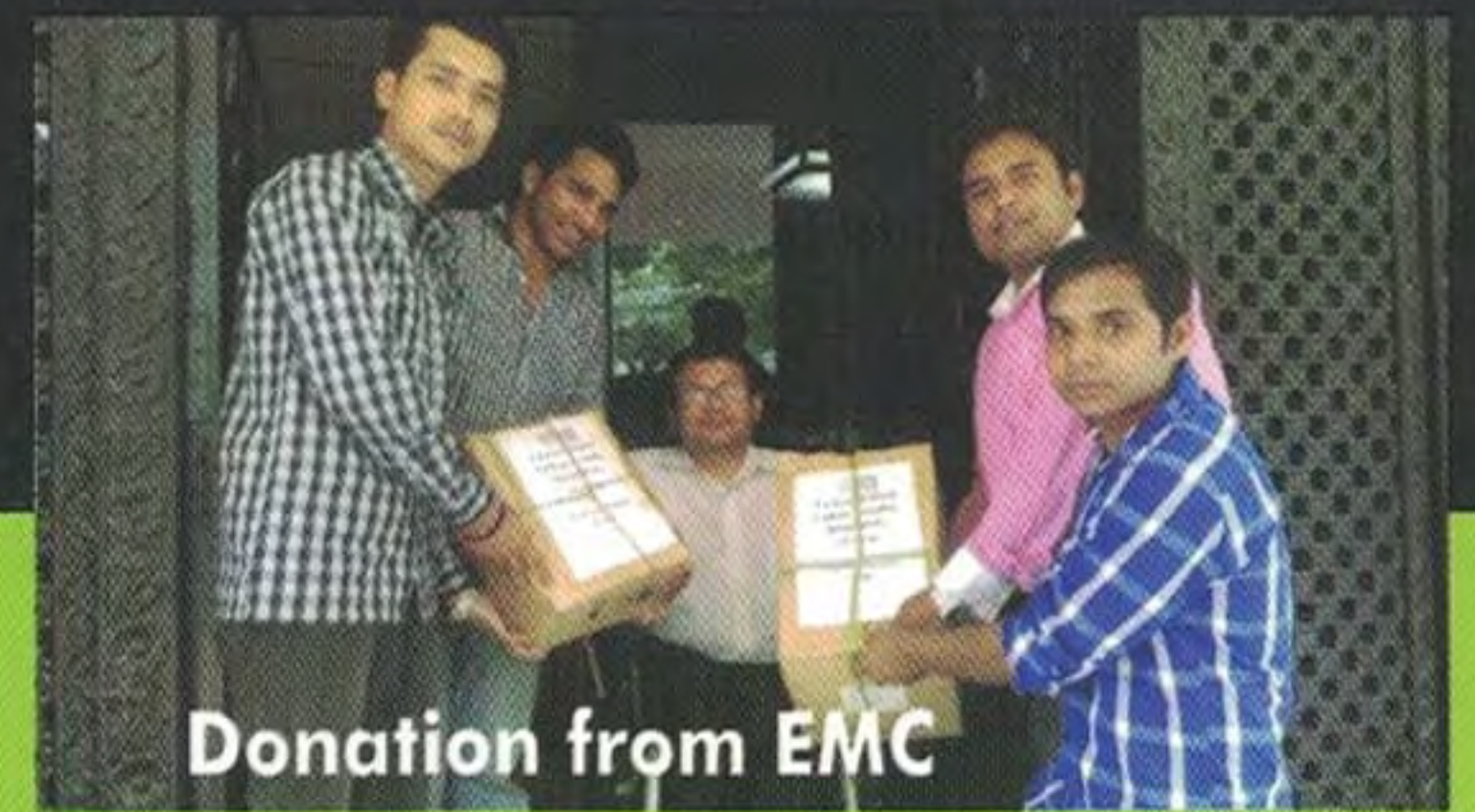
Donation from EMC