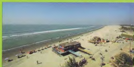
World's Longest Sea Beach Cox's Bazar