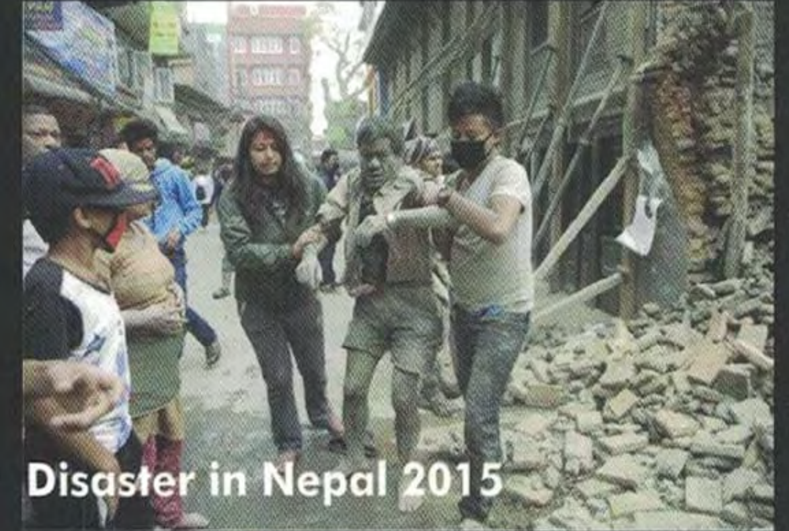
Disaster in Nepal 2015

We deeply sympathize with the Earthquake victims of Nepal.