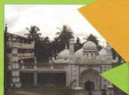
Shah Suja Masjid, Comilla