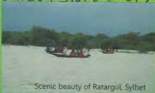
Scenic beauty of Ratargul, Sylhet