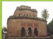
Kantaji Temple, Dinapur