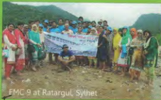
EMC 9 at Ratargul, Sylhet