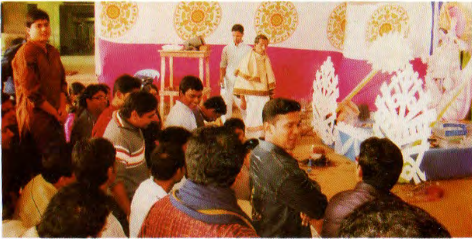
Students celebrating Sharaswati Puja at the College Campus.