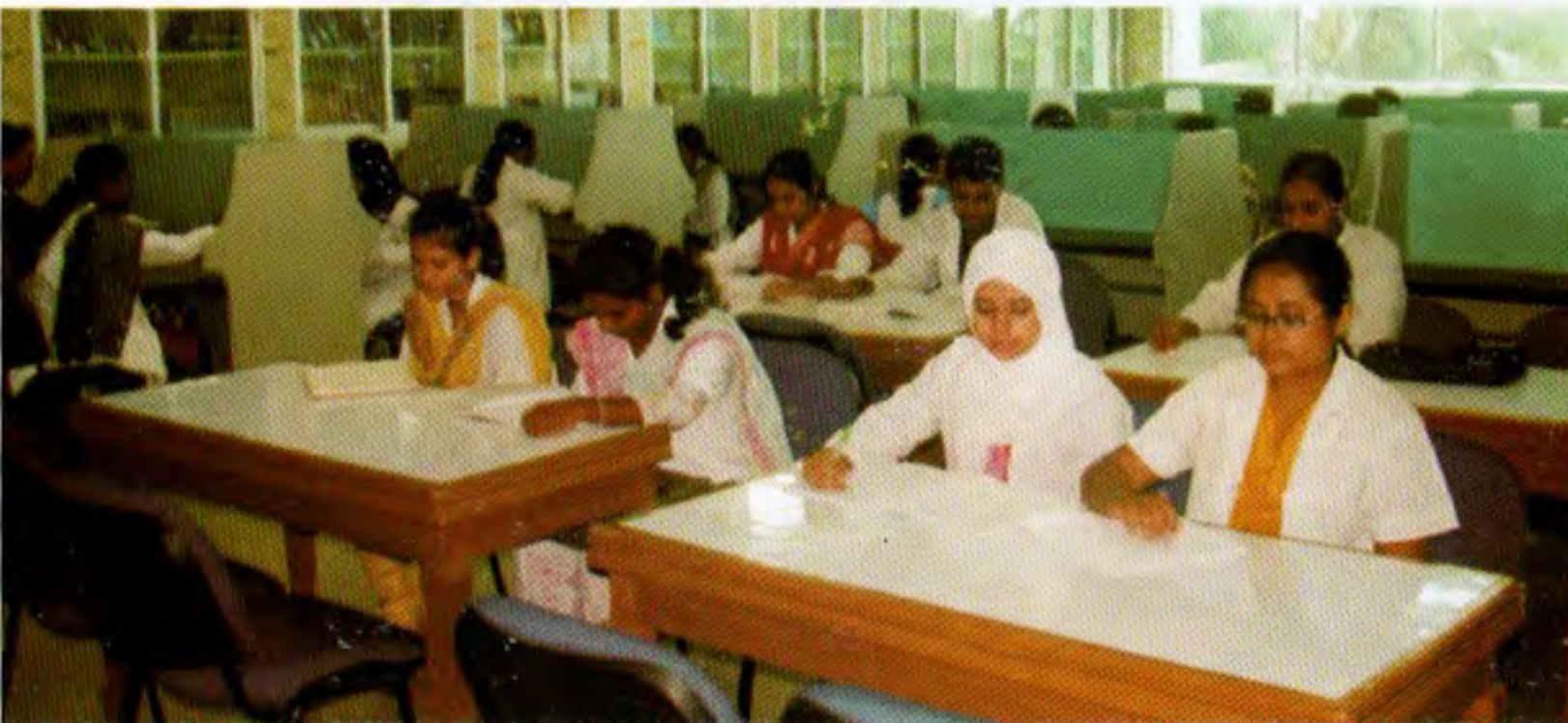
Students in Library room