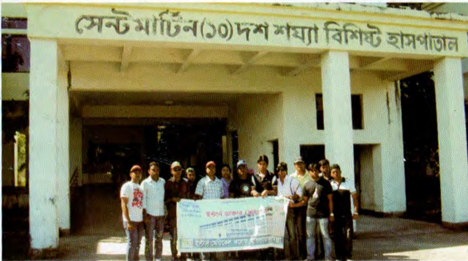
Students participating in Outdoor Clinic in Saintmartin Island.