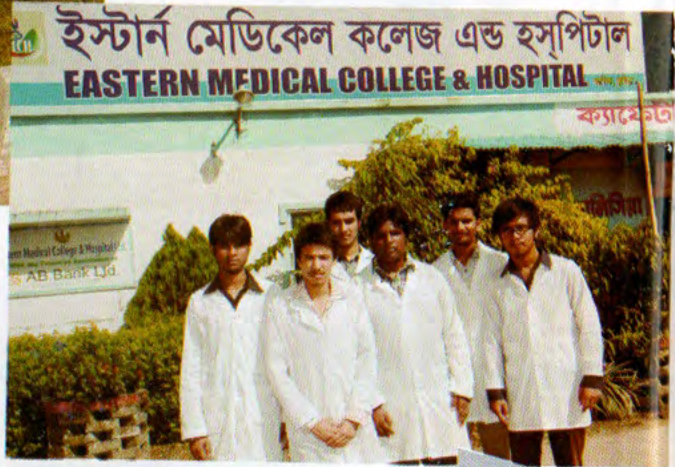
Foreign Students in the campus