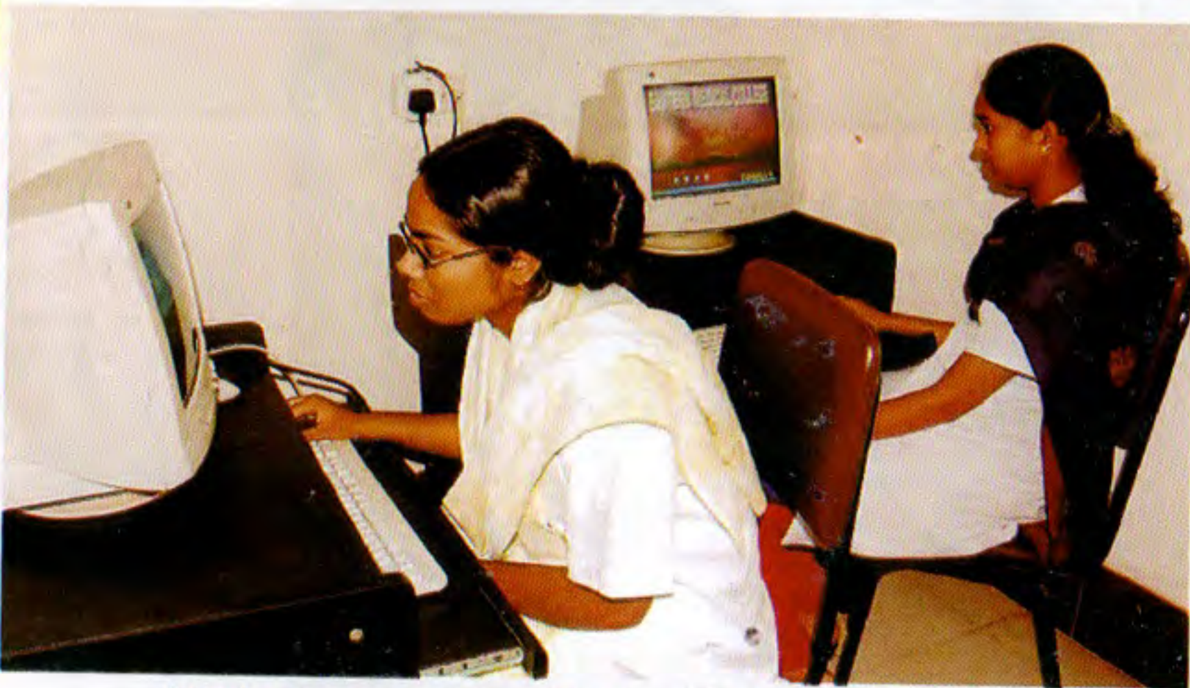
Students searching Medical information from Internet.