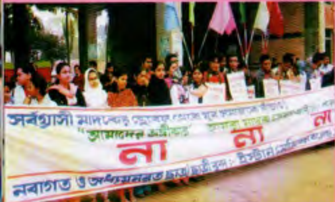
Students of Eastern Medical College during an Anti Drug Campaign held in the College Campus.