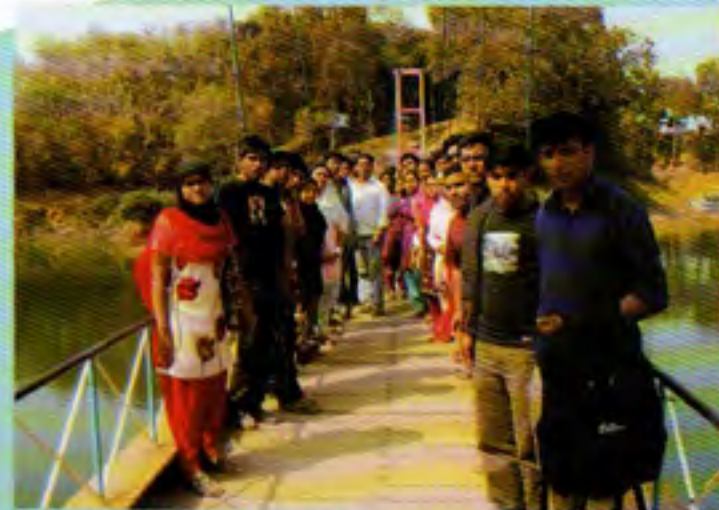
Picnic EMC 5 Batch at Rangamati