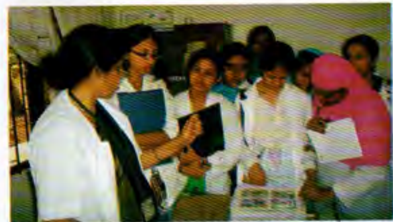
Students of EMC during a Day Visit at Rajdebi Maternity Clinic

That, According to my ability and judgment, I will keep this Oath and this stipulation - to reckon him who taught me this Art equally dear to me as my parents, to share my substance with him, and relieve his necessities if required; To look upon his offspring in the same footing as my own brothers, and to teach them this Art, if they shall wish to learn it, without fee or stipulation;