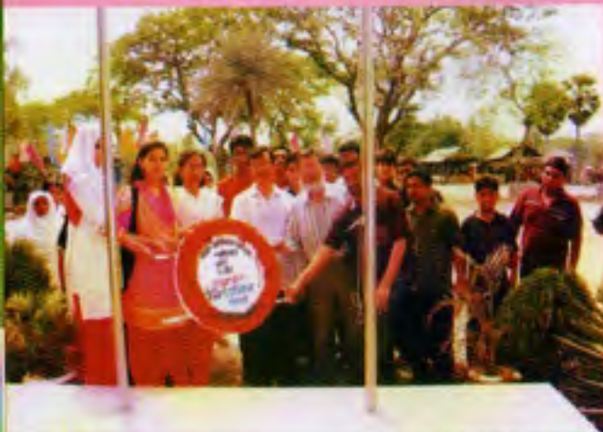
Students of EMC laying Floral Wreath on the occasion of Independence day.