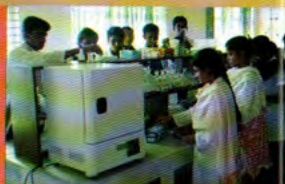
Students Working in the Biochemistry Lab