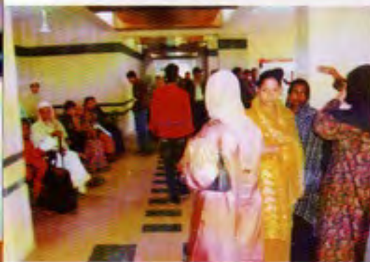
Entry - Hospital Outdoor