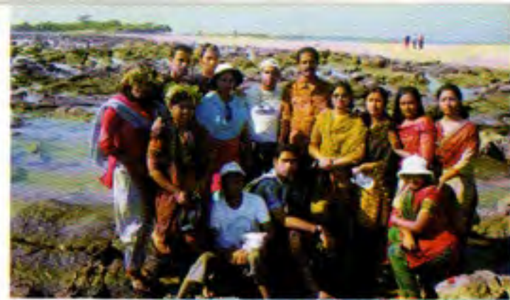
EMC Batch-1, Tour at Chara Dip Island

1st year class usually starts from 1st week of January each year or as notified by the college authority.