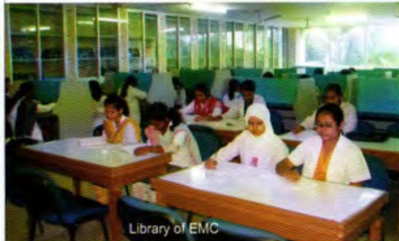
Library of EMC