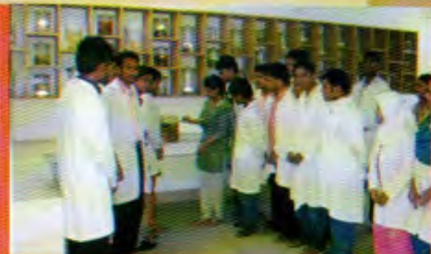
Students Working in the Pathology Museum