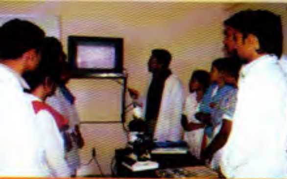
Students Working in the Histology Lab

I make these promises solemnly, freely and upon my honor*.