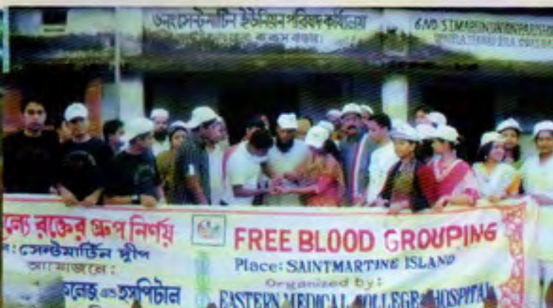
Study Tour of EMC Batch-1 at Saintmartin Island