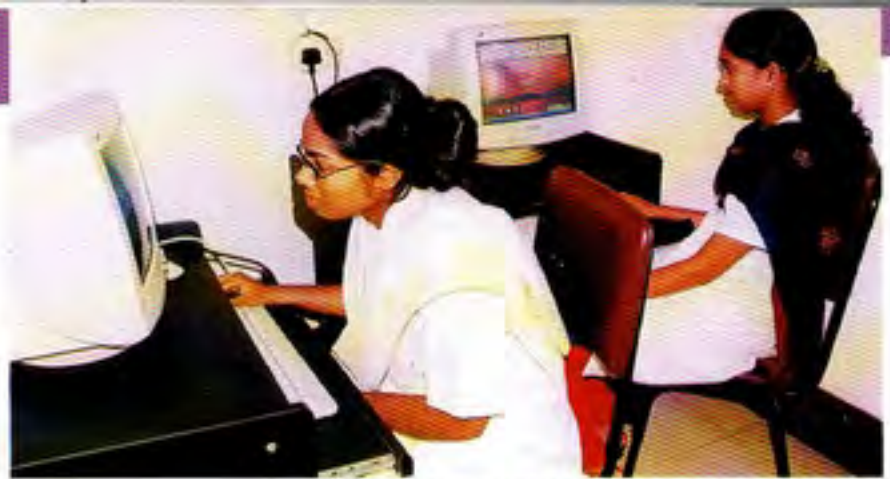
Students searching Medical information from Internet.