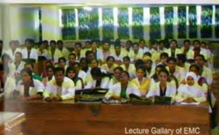
Lecture Gallery of EMC