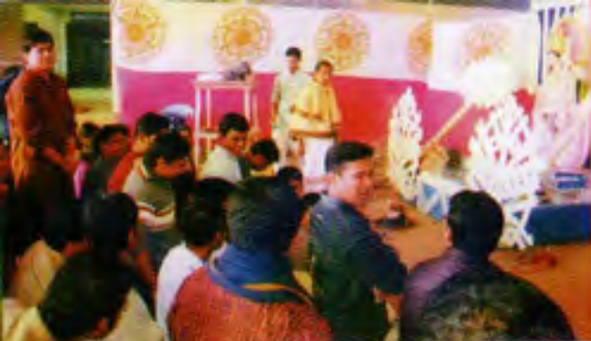
Students celebrating Sharaswati Puja at the College Campus.