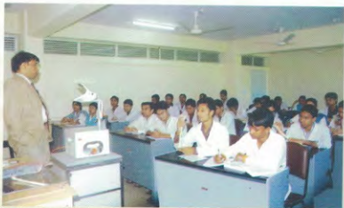
▶ Lecture Theatre