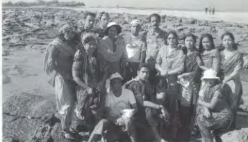
▶ EMC Batch-1, Tour Chara Dip Island