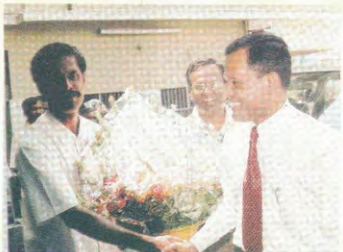
▶ Inspection Team of Ministry of Health in the College Campus