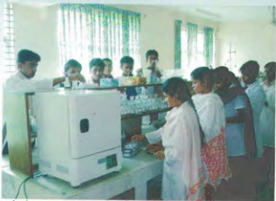
▶ Students Working in the Histology & Biochemistry Lab