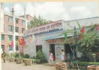
▶ College Canteen