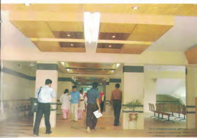
Outdoor Block of EMC Hospital