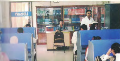
Library of EMC