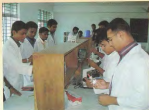
▶ Students Working in the Physiology Lab