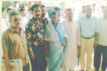
▶ Inspection team of the University of Chittagong in the College Campus