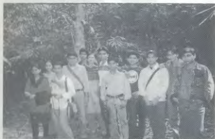
► EMC-2 Batch in the Picnic Spot at Srimongal, Sylhet.