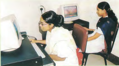
▶ Students Browsing on Internet.