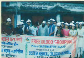
► Study Tour of EMC Batch-1 Saintmartine Island