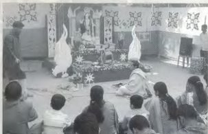
► Students celebrating Sharaswati Puja at the College Campus