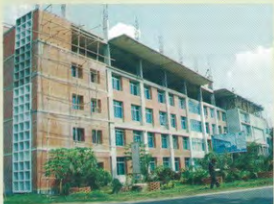
► EMC New Campus at Kabila, Comilla