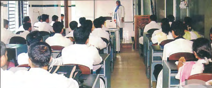
Lecture Theatre of EMC