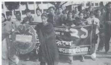
▶ Programme in memory of 21st February'09