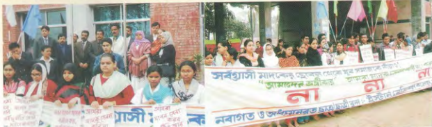
▶ Students of Eastern Medical College during an Anti Drug Campaign held in the College Campus.