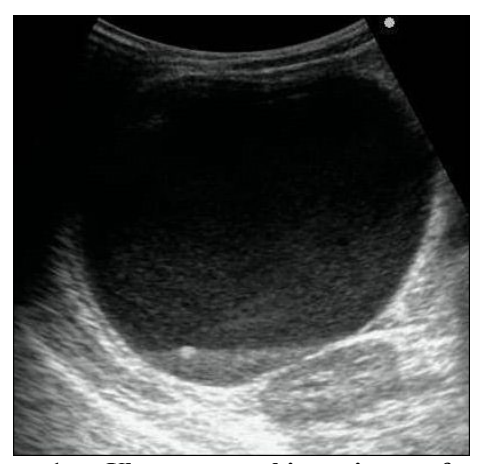
Figure-1: Ultrasonographic view of the mesenteric cyst

palpable masses, and no palpable lymph nodes. An ultrasound scan of the pelvis was arranged which found a ( 116 \times 104 \times 76 ) mm³ cystic lesion probably from the left ovary (Figure-1). Test results for blood showed a normal hemoglobin level of 10.0 g/dl. Tests for liver function revealed direct bilirubin levels of 0.02 mg/dl, total bilirubin of 0.23 mg/dl, alanine aminotransferase (ALT) of 12 IU/L and aspartate aminotransferase (AST) of 15 IU/L, serum creatinine 0.46 and serum TSH 1.7 \mu IU/ml. A CT scan of whole abdominal showed a large well-defined cystic lesion ( 116 \times 104 \times 76 mm³) with a peripherally enhancing wall seen in the left lower and middle quadrant abdomen likely benign cyst but could not determine its origin (Figure-2).