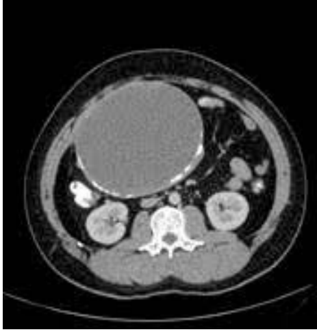
Figure-2: Computed tomography view of the mesenteric cyst

The patient was taken to the operating room for an exploratory laparotomy through a midline incision, which revealed a ( 11 \times 10 ) cm cyst originating from the ileum. The lower part of the cyst entrapped the left ovary, and partially the right ovary as well. The cyst was filled with brownish fluid. With join consultation with surgeon, Cautious dissection of the adhesions between the cyst and its surroundings